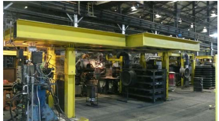
Impact Absorbing Overhead Guard