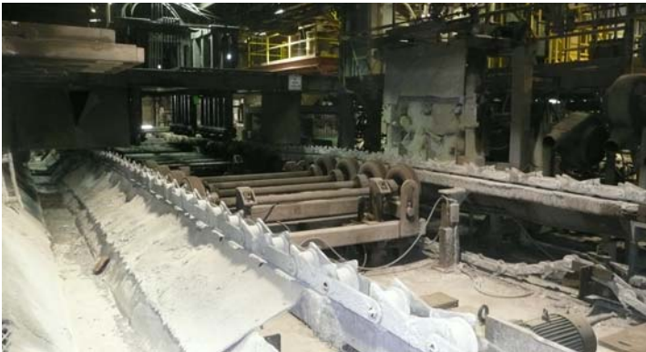
Cement Line Conveyor, Laitance Wash, and Drying Station

Nuway provides engineered machine designs in SolidWorks™ 3D. Automation controls with hydraulic and pneumatic circuits complete the packages. Nuway also offers installation crews led by the designers and engineers to insure that the equipment is setup for successful operation.