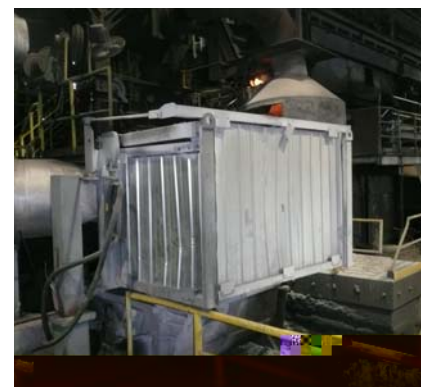
Deployable Inoculation Hood